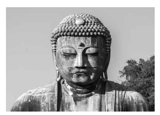
Buddhist statue in Japan

For example, Buddhism, secular humanism, and biblical Christianity are entirely different religions that do not share a common historical foundation. Each of these religions has variations within its constituents —